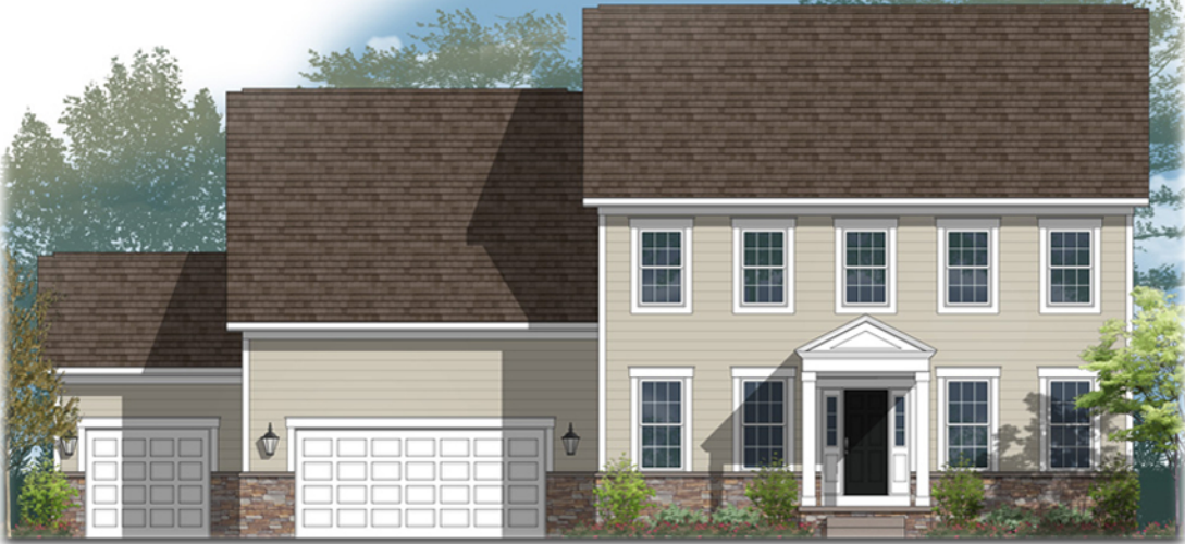
3,234 square feet • 4 bedroom • 3.5 baths